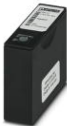
Replacement UV fluid, 23 ml, color: magenta

Please be informed that the data shown in this PDF Document is generated from our Online Catalog. Please find the complete data in the user's documentation. Our General Terms of Use for Downloads are valid ( http://phoenixcontact.com/download )