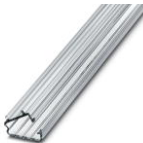
Cover profile, length: 300 mm, color: transparent

Please be informed that the data shown in this PDF Document is generated from our Online Catalog. Please find the complete data in the user's documentation. Our General Terms of Use for Downloads are valid ( http://phoenixcontact.com/download )